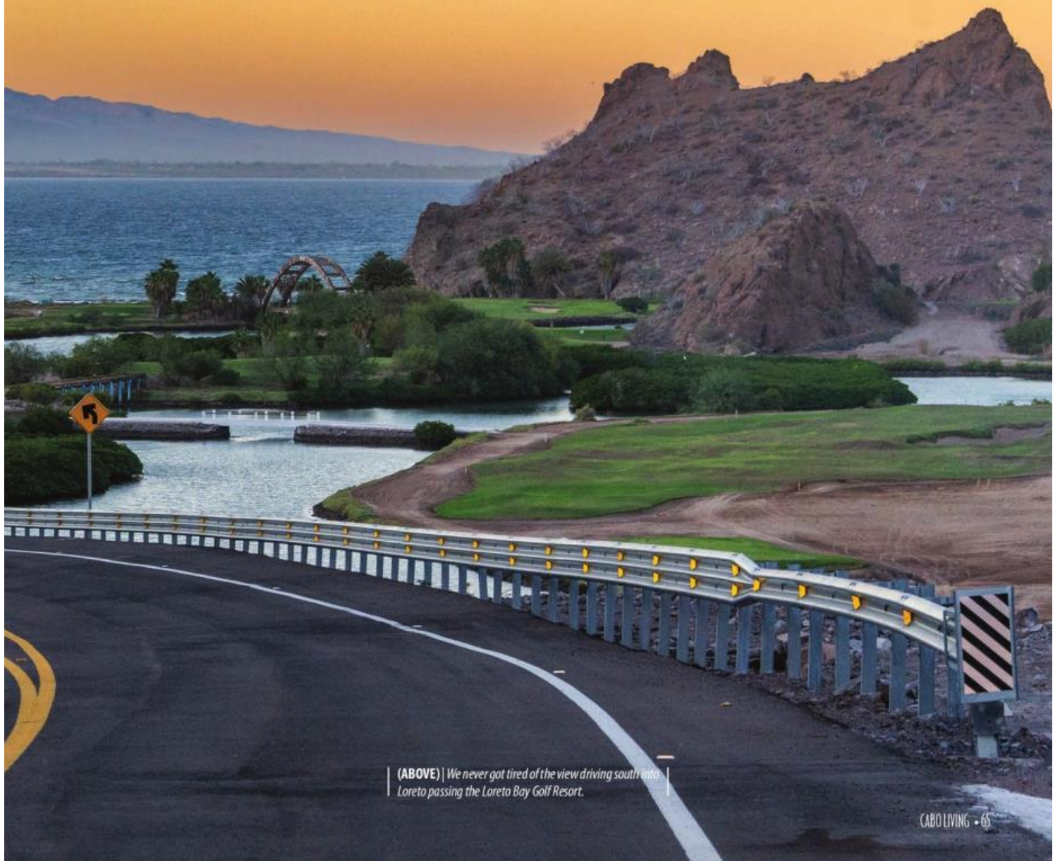
(ABOVE) | We never got tired of the view driving south into Loreto passing the Loreto Bay Golf Resort.