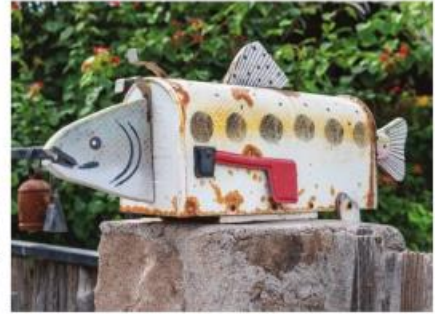
(ABOVE AND BELOW) | Spa Las Flores. Stepping inside Curios La Casa de La Abuela was like stepping back in time - and we found a few old treasures amongst the curios and souvenirs. The unlikely duo of a pug and an iguana guarding the curio shop. Loreto is a very colorful town. They love their mailboxes. We met a man who made this alter in his driveway. Pelicans in the bay.

It was only a few short blocks through the cooling evening air to the zócalo and Spa Las Flores. Luckily, they had an opening for both of us and, an hour later, we stumbled into Orlando's for dinner feeling very, very relaxed. It had been a very good massage. A few palomas, cochinita pibil, and a freshly caught fish filet done simply on the grill, and