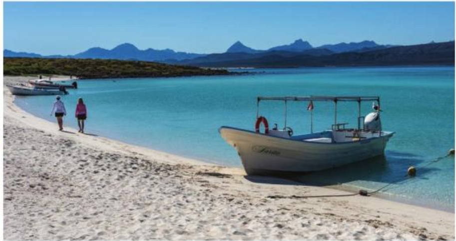
(ABOVE AND BELOW) | Never a dull day snorkeling in the Sea of Cortez. Our cove on Coronado. It's hard to grasp how large a fin whale is as this is just a small part of her. They generally don't breach or spyhop like humpbacks or grays.

and including five rocky islands: Coronado, Danzante, Carmen, Monserrat, and Santa Catalina - happened in 1996, and in 2005, UNESCO declared Loreto Bay National Park a world Heritage site. The islands stunning in their starkness and how their sharp peaks and cliffs stand out against the unending blue sky.