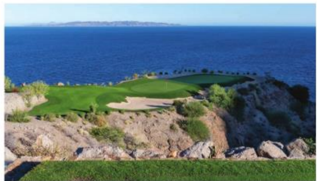
(ABOVE AND BELOW) | The surprise picnic lunch waiting for us on Carmen Island. It's one of the outings that Marina Puerto Escondido offers. What a setting for a picnic! Clams chocolates was the order of the day for our picnic. Fresh-caught ceviche at our picnic. The signature Hole #17 at Danzante Bay golf course at the Islands of Loreto resort. Loreto street vendor on the Camino Real. Every town has one of these but few have a setting quite as stunning.

style beach chairs with plates piled high.