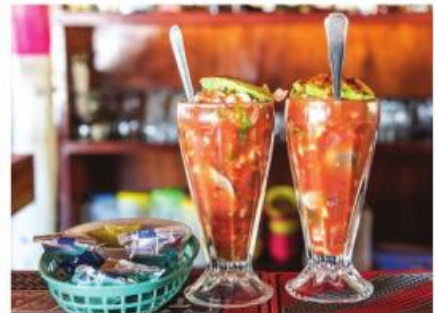
(ABOVE) | San Javier Mission. The oldest olive tree in North America. Vista del Mar. The “patio” at the “Clam Shack” (Vista del Mar). Shrimp cocktails at the “Clam Shack” (Vista del Mar).

sitting in a pew gave us a quiet opportunity to admire and appreciate what was built so many centuries ago. The wood and stone carvings, the opulent gold leaf, and the beautiful cupola were breathtaking.