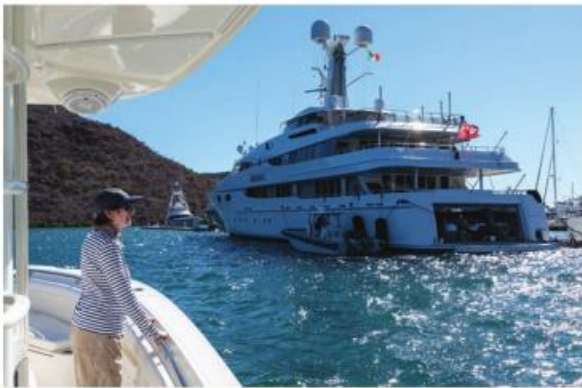
(BELOW) | Passing a few mega-yachts at the marina. Cruising around Danzante Island. The mega-yachts in Marina Puerto Escondido.

A hotel is in the works, but the important and ambitious piece of the puzzle is the planned real estate community Waicuri on the man-made islands at the marina. The first phase includes 19 lots for custom homes – all facing the water and each with its own dock which can host yachts up to 100'. An incredible model home sits on one lot, with another being built next door, and they have plans in place to begin more custom home construction throughout 2022. The house is jaw-droppingly beautiful with state-of-the-art finishes throughout and as an example, it's not at all difficult to envision what the fully built community will look like.